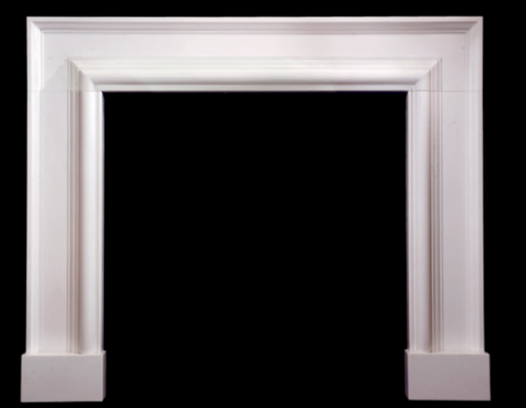
Pattern No. 1