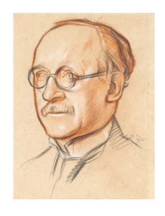
Sir Edwin Lutyens

"...tradition to me consists in our inherited sense of structural fitness, the evolution of rhythmic form by a synthesis of needs and materials..."